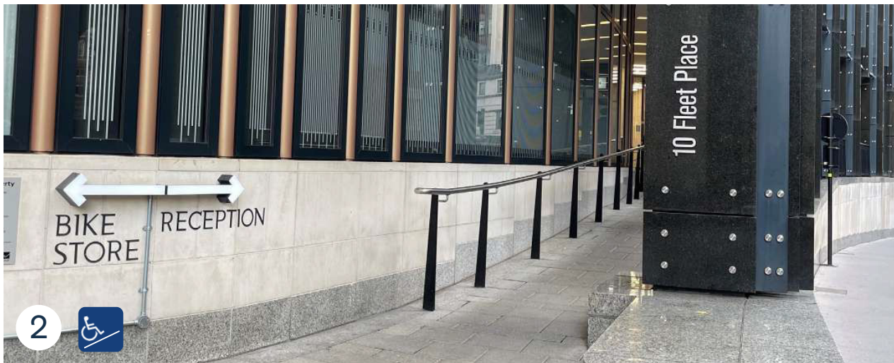
Step free access via Limeburner Lane – please turn left at the end of the ramp to access 5 Fleet Place.